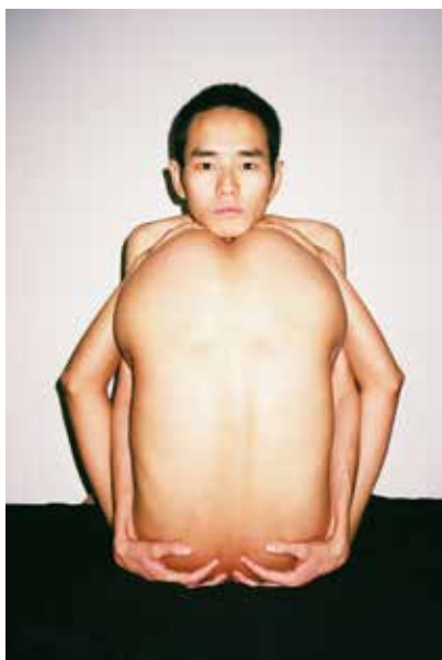
RH03 Untitled China, 2015

Ren Hang's work has been exhibited in many galleries around the world and regularly published in fashion magazines including Purple and Numero . After his suicide in 2017, he left behind a wide-ranging body of work that is presented in the exhibition “LOVE, REN HANG”, which deals with all aspects of his artistic practice, from photography to books and self-published texts. Presented for the first time in a French institution - in Paris, a city he loved - 150 photographs selected by the MEP from European and Chinese collections allow us to assess the scope of his outstanding corpus.