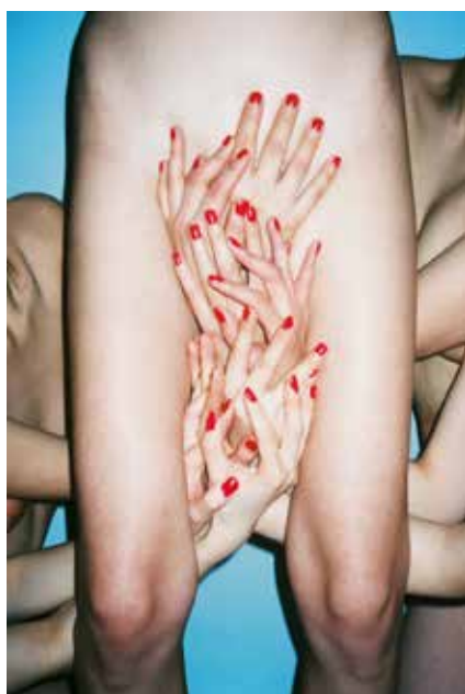
RH05 Untitled China, 2015

différents univers. Avec une approche chromatique, le visiteur traverse les différentes constellations de son univers onirique : la présence du rouge, les couleurs acidulées, une salle consacrée à sa mère, une autre, plus sombre, dédiée à des prises de vue nocturnes. Une dernière salle rassemble un travail plus « osé » sur le corps, créant un lien, fort et organique, entre l'érotisme et la nature.