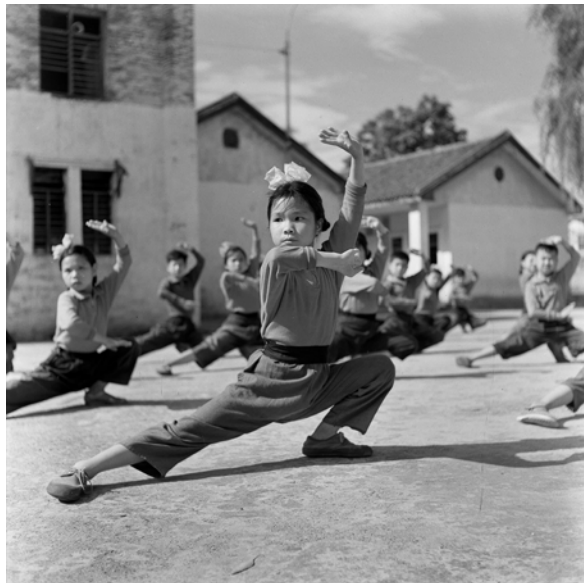
Left: Students During PE Class at Third Primary School in Lianzhou, 1970s, Photo by Du Jixi

the collection, anonymous pictures, chosen as social and cultural testimonies of their time, but also because of their very human dimension. Working on that visual corpus, Jean-Marie Donat formed over 200 thematic series. In some cases, the series go beyond their subject, transfiguring the images.