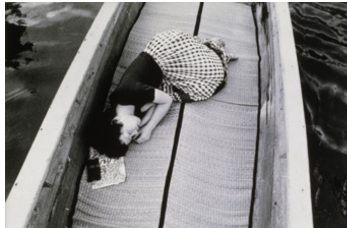
LS04 Nobuyoshi Araki from the series "Sentimental Journey", 1971 Gelatin silver print Collection MEP, Paris. Donation from Dai Nippon Printing Co., Ltd.