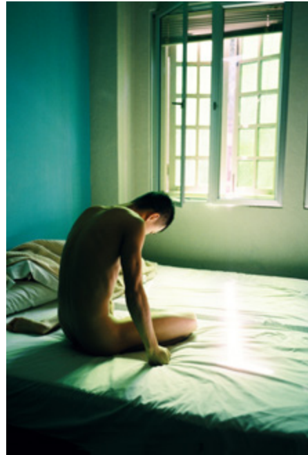
LS02 Lin Zhipeng (aka N°223) Green light , 2010 Pigment print © N°223, courtesy in)(between gallery