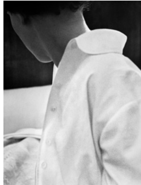
LS01 René Groebli from the series "L'œil de l'amour", 1952 Gelatin silver print © René Groebli, courtesy Galerie Esther Woerdehoff

The press photos are copyright free for the promotion of the exhibition at the MEP and for its duration only. They cannot be cropped or modified, or have any text added onto them.