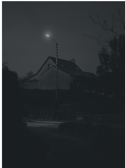
STUDIOME06 Manon Lanjouère Au sud de nulle part, Demande à la poussière , 2017