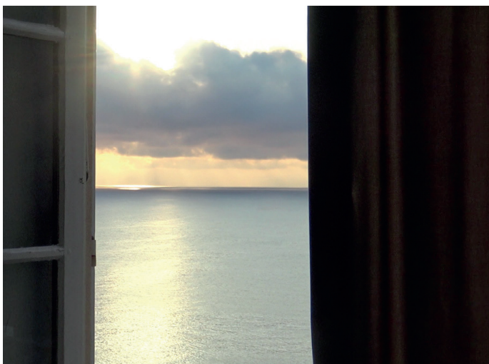
STUDIOME07 Adèle Gratacos de Volder Still from Jamais indemne , 2019