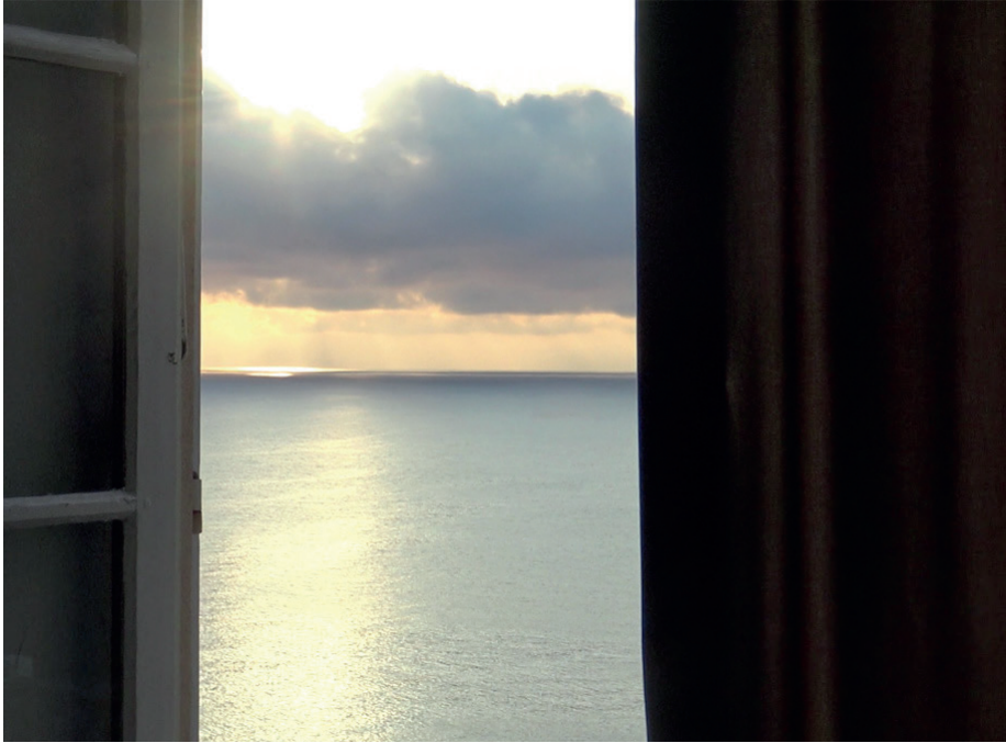
Adèle Gratacos de Volder Still from Jamais indemne , 2019

Adèle Gratacos de Volder has developed a multidisciplinary practice and a unique use of images, sounds and texts to explore the fragility of intimacy. She presents in KYOTOGRAPHIE her film Jamais indemne ! Un cœur à corps in a confidential space where the walls are covered by her writings. This immersive installation, inspired by her exhibition at MEP in 2019, shows the artist's constant questions and describes a mental landscape made up of haunting images, random note-taking and persistent memories.