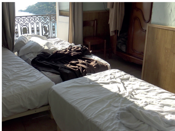
STUDIOME08 Adèle Gratacos de Volder Still from Jamais indemne , 2019 © Adèle Gratacos de Volder