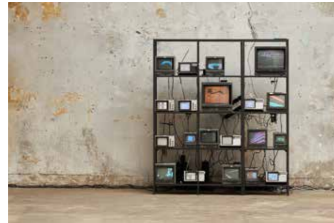
PXL CTY, 2021

The press images are copyright free for the promotion of the exhibition at the MEP and for its duration only. They cannot be cropped or modified, or have any text added onto them.