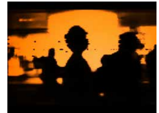
PXL CTY, 2021