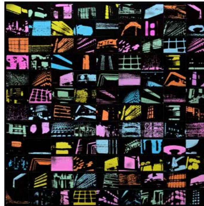
PXL CTY, 2021 © Antony Cairns